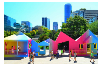
New Annual Arts and Cultural Event Permit