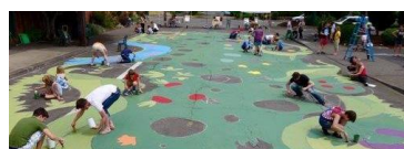
OCF Arts and Culture Grants