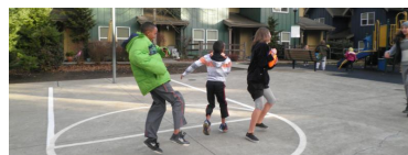
Affordable Homes for Greater Portland Survey