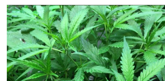
Apply for a Cannabis